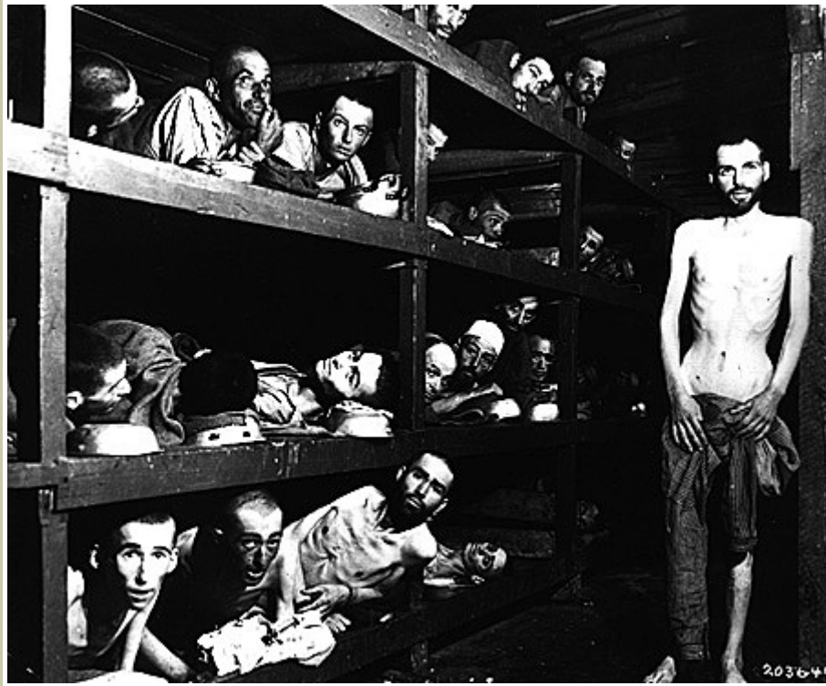
The barracks at Buchenwald. Elie Wiesel is among the prisoners on the far right of the center bunk. This photograph was taken on April 16, 1945, just after the liberation of Buchenwald.