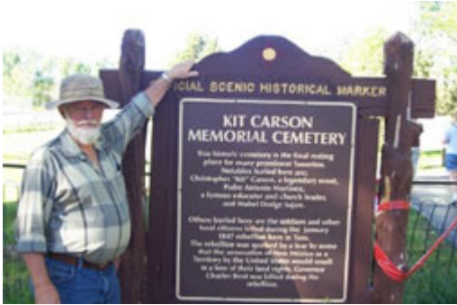
Taos, New Mexico