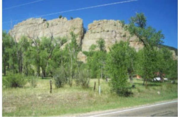
Stonewall, Colorado: close to Russell gravesite and homestead