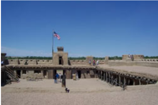
Bent's Fort in Eastern Colorado