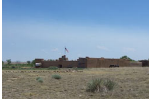
Inside view of Bent's Fort